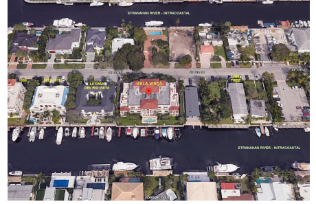
Built in 2015 - 9 units - 4 floors

Number of units: 9 Number of active listings for rent: 1 Number of active listings for sale: 3 Building inventory for sale: 33% Number of sales over the last 12 months: 2 Number of sales over the last 6 months: 1 Number of sales over the last 3 months: 1 Vela Vista 1532 S.E. 12th Street Fort Lauderdale, FL 33316 https://