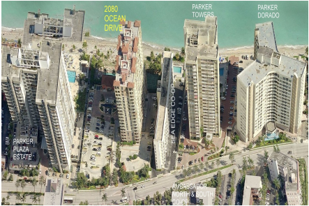
Built in 2003 - 233 units - 18 floors

Number of units: 233 Number of active listings for rent: 5 Number of active listings for sale: 8 Building inventory for sale: 3% Number of sales over the last 12 months: 11 Number of sales over the last 6 months: 7 Number of sales over the last 3 months: 5 2080 Ocean Drive Condominium association front desk: (954) 456-0200 main office: (954) 456-5215 manager2080@yahoo.com https://