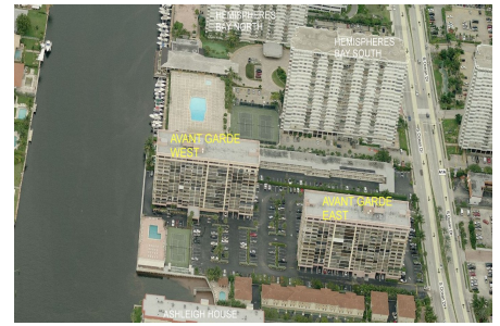
Built in 1975 - 139 units - 15 floors

Avant Garde Condominium Association Inc (954) 454-7585