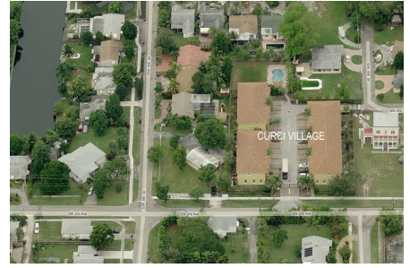
Built in 2006 - 15 units - 2 floors

Curci Village Condominium Association (954) 454-8852