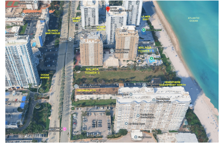
Built in 1976 - 145 units in total - 20 floors

Number of units: 145 Number of active listings for rent: 4 Number of active listings for sale: 12 Building inventory for sale: 8% Number of sales over the last 12 months: 10 Number of sales over the last 6 months: 5 Number of sales over the last 3 months: 3 Malaga Towers Condominium 1920 S Ocean Dr, Hallandale Beach, FL, 33009 https://