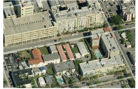
Built in 2006 - 166 units - 8 floors