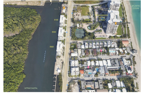
Built in 2013 - 19 units - 4 floors

Number of units: 19 Number of active listings for rent: 1 Number of active listings for sale: 6 Building inventory for sale: 31% Number of sales over the last 12 months: 2 Number of sales over the last 6 months: 1 Number of sales over the last 3 months: 0 Seaside Village Address: 349 Palm St, Hollywood, FL 33019 Phone: +1 954-261-2727 https://