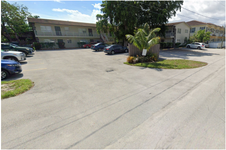
Built in 2006 - 40 units - 2 floors