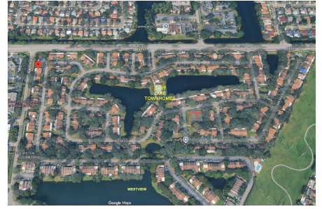
Built in 1982 - 332 units - 1 floor

9732 NW 16th Ct, Hollywood, FL, 33024 Phone: (954) 432-6888 Fax: (954) 432-9037 https://eastlakeshoa.com/