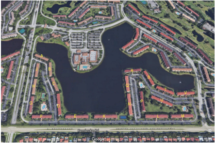
Built in 1992 - 688 units - 4 floors