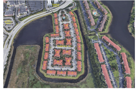
Built in 2007 - 148 units - 2 floors

Pembroke Cay Condo Association 814 SW 143rd Terrace Pembroke Pines, FL 33027 Phone: (954) 435-5204 https://