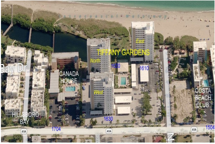
Built in 1969 - 65 units - 13 floors