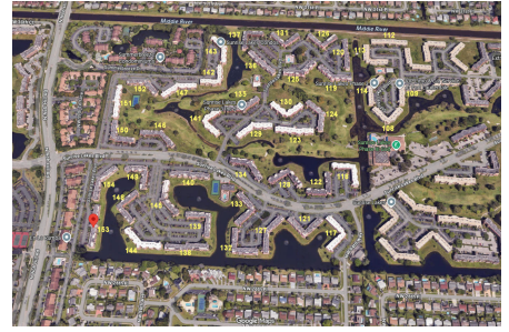
Built in 1980 - 786 units - 3 floors

Number of units: 786 Number of active listings for rent: 0 Number of active listings for sale: 46 Building inventory for sale: 5% Number of sales over the last 12 months: 38 Number of sales over the last 6 months: 16 Number of sales over the last 3 months: 7 Sunrise Lakes Condominium Association Address: 8100 Sunrise Lakes Dr N, Sunrise, FL 33322 Phone: +1 954-741-0446 https://www.sunriselakes4-1.com/