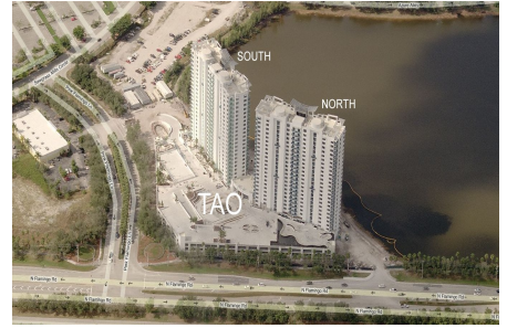
Built in 2009 - 198 units - 26 floors

Number of units: 198 Number of active listings for rent: 6 Number of active listings for sale: 32 Building inventory for sale: 16% Number of sales over the last 12 months: 20 Number of sales over the last 6 months: 9 Number of sales over the last 3 months: 5 Tao Condominium (954) 837-0550 https://