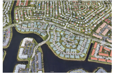
Built in 2000 - 232 units - 2 floors

Number of units: 232 Number of active listings for rent: 1 Number of active listings for sale: 4 Building inventory for sale: 1% Number of sales over the last 12 months: 12 Number of sales over the last 6 months: 5 Number of sales over the last 3 months: 4 Kings Point 7620 Nob Hill Road, Tamarac, FL 33321 Tel. (954)726-4120 https://