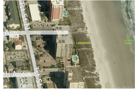
Built in 2002 - 43 units - 11 floors

Number of units: 43 Number of active listings for rent: 0 Number of active listings for sale: 1 Building inventory for sale: 2% Number of sales over the last 12 months: 7 Number of sales over the last 6 months: 1 Number of sales over the last 3 months: 1 Landmark Condominium Association 1331 1st St N Jacksonville Bch, FL (904) 242-9551 https://