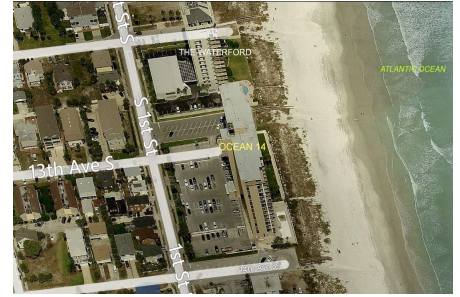
Built in 1976 - 124 units - 17 floors