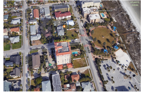
Built in 2007 - 17 units - 9 floors