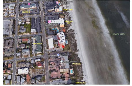
Built in 2001 - 46 units - 12 floors

Number of units: 46 Number of active listings for rent: 0 Number of active listings for sale: 0 Building inventory for sale: Number of sales over the last 12 months: 0% Number of sales over the last 6 months: 1 Number of sales over the last 3 months: 0 The Oceania of Jacksonville Beach Association 1011 3rd Street North, Jacksonville Beach, FL 32250 https://theoceaniacondos.com/