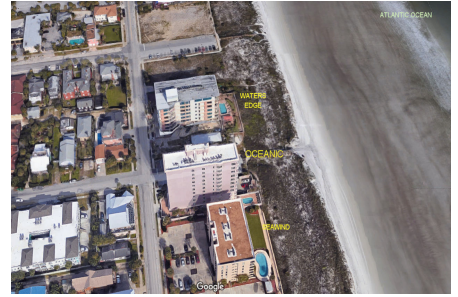
Built in 2003 - 10 units - 11 floors

Number of units: 10 Number of active listings for rent: 0 Number of active listings for sale: 0 Building inventory for sale: Number of sales over the last 12 months: 0% Number of sales over the last 6 months: 0 Number of sales over the last 3 months: 0