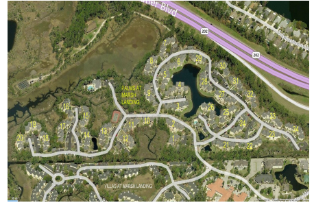
Built in 2003 - 403 units - 3 floors

https://www.thepalmsatmarshlanding.org/outside_home.asp