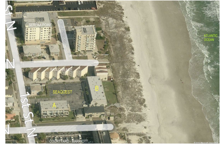
Built in 1983 - 24 units - 2 floors

Number of units: 24 Number of active listings for rent: 0 Number of active listings for sale: 1 Building inventory for sale: 4% Number of sales over the last 12 months: 1 Number of sales over the last 6 months: 1 Number of sales over the last 3 months: 0 Seaquest Condominium Association Address: 1701 1st St N, Jacksonville Beach, FL 32250, Phone:+1 904-247-3541 https://