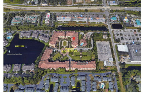
Built in 2006/2013 - 204 units - 4 floors

Valencia at South Beach Address: 4300 S Beach Pkwy, Jacksonville Beach, FL 32250 Phone: +1 904-273-9891 https://www.valenciaatsouthbeach.com/