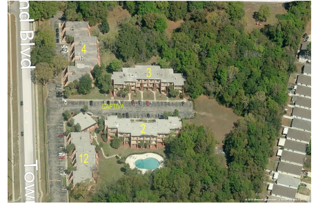
Built in 1974 - 64 units - 3 floors

Number of units: 64 Number of active listings for rent: 0 Number of active listings for sale: 0 Building inventory for sale: Number of sales over the last 12 months: 0%% Number of sales over the last 6 months: 1 Number of sales over the last 3 months: 0 CAPTIVA CONDOMINIUM ASSOCIATION, INC. LELAND MANAGEMENT INC PHONE 407-447-9955 FAX 407-447-9899 https://