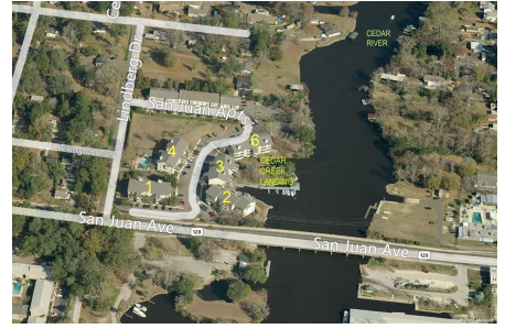
Built in 1987 - 60 units - 3 floors

Cedar Creek Landing Condominium Association Address 5615 San Juan Ave Jacksonville, Florida 32210 Phone +1 904-781-3721 https://