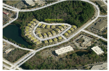
Built in 2005 - 93 units - 2 floors

https://deerfootpoint.com/deerfootpoint/home.asp