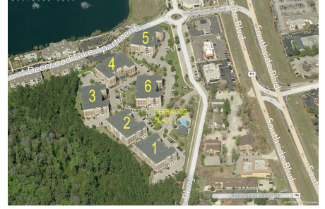
Built in 2005 - 182 units - 5 floors