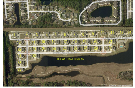
Built in 2005 - 134 units - 2 floors

EDGEWATER AT SUNBEAM CONDOMINIUM ASSOCIATION, INC. 7400 BAYMEADOWS WAY STE 317 JACKSONVILLE FL 32256 PHONE 904-367-8532 FAX 904-367-8554 https://