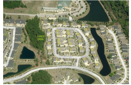
Built in 2004 - 96 units - 2 floors

FOREST CREEK CONDOMINIUM ASSOCIATION, INC. INTERLACED PROPERTY SOLUTIONS LLC 390 KORI RD STE 9 JACKSONVILLE FL 32257 888-599-8249 http://fccai.com/301.html