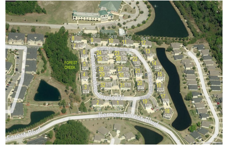
Built in 2004 - 96 units - 2 floors

FOREST CREEK CONDOMINIUM ASSOCIATION, INC. INTERLACED PROPERTY SOLUTIONS LLC 390 KORI RD STE 9 JACKSONVILLE FL 32257 888-599-8249 https://fccai.com/301.html