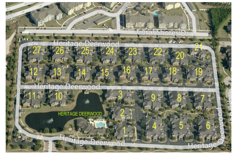
Built in 2001 - 210 units - 2 floors

Number of units: 210 Number of active listings for rent: 0 Number of active listings for sale: 0 Building inventory for sale: Number of sales over the last 12 months: 0% Number of sales over the last 6 months: 0 Number of sales over the last 3 months: 0 HERITAGE DEERWOOD 10901 Burnt Mill Rd Jacksonville, FL 32256 tel 904.642.1658 fax 904.642.1739 https://