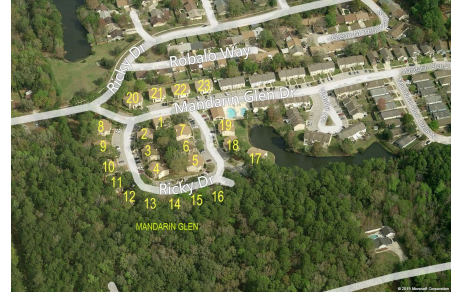
Built in 1985 - 92 units - 2 floors

Number of units: 92 Number of active listings for rent: 1 Number of active listings for sale: 1 Building inventory for sale: 1% Number of sales over the last 12 months: 4 Number of sales over the last 6 months: 2 Number of sales over the last 3 months: 0 Mandarin Glen Homeowners Association Address: 7235 Bonneval Rd, Suite 270 Jacksonville, FL 32256 Phone: (904) 220-8009 Fax: (904) 592-2270 https://mandaringle.com/main.php?IMenuID=2115