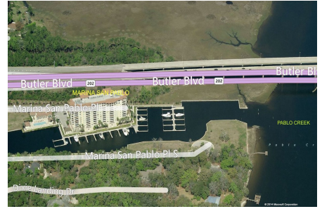
Built in 2006 - 56 units - 10 floors

https://marinasanpablocondos.com/outside_home.asp