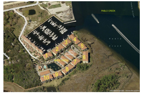
Built in 2005 - 150 units - 3 floors

Number of units: 150 Number of active listings for rent: 3 Number of active listings for sale: 8 Building inventory for sale: 5% Number of sales over the last 12 months: 13 Number of sales over the last 6 months: 4 Number of sales over the last 3 months: 1 Mira Vista Condominium Association 13846 Atlantic Blvd. #211 Jacksonville, FL 32225 https://miravistacondos.org/miravista/home.asp