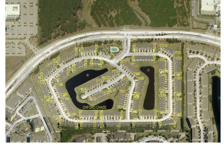
Built in 2004 - 250 units - 2 floors

https://oxfordchasehoa.org/outside_home.asp