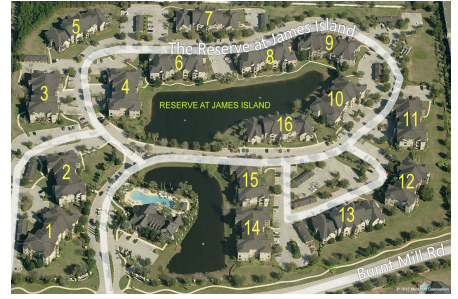
Built in 2001 - 354 units - 3 floors

Number of units: 354 Number of active listings for rent: 1 Number of active listings for sale: 11 Building inventory for sale: 3% Number of sales over the last 12 months: 24 Number of sales over the last 6 months: 12 Number of sales over the last 3 months: 6 Reserve At James Island Condos Office 10961 Burnt Mill Rd, Jacksonville, FL 32256 (904) 565-6016 https://reserveji.com/outside_home.asp