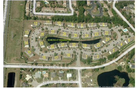
Built in 1998 - 192 units - 2 floors

KENSINGTON ASSOCIATION, INC. BCM SERVICES, INC. PO BOX 161088 JACKSONVILLE FL 32266 PHONE 907-242-0666 FAX 907-242-0670 https://www.kensingtonassociation.com/kensingtonassociation/page.html