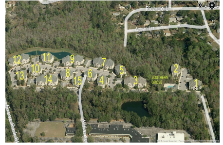
Built in 2001 - 240 units - 3 floors

SOUTHERN GROVE CONDOMINIUM ASSOCIATION, INC COMMUNITY MANAGEMENT CONCEPTS OF JACKSONVILLE 7400 BAYMEADOWS WAY STE 317 JACKSONVILLE FL 32256 PHONE 904-367-8532 FAX 904-367-8554 https://