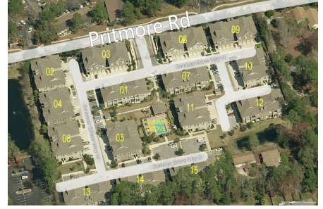
Built in 2003 - 120 units - 2 floors

SUMMER GROVE CONDOMINIUM ASSOCIATION, INC. MAY MANAGEMENT SERVICES INC 5455 A1A S # 3 SAINT AUGUSTINE FL 32080 PHONE 904-561-9708 FAX 904-461-0335 https://