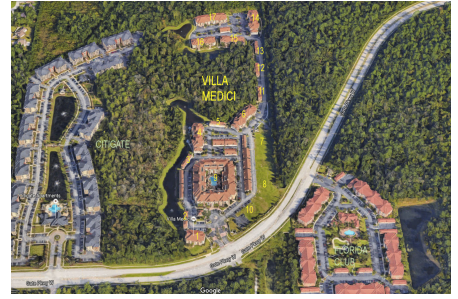
Built in 2007 - 379 units - 4 floors

Number of units: 379 Number of active listings for rent: 5 Number of active listings for sale: 12 Building inventory for sale: 3% Number of sales over the last 12 months: 9 Number of sales over the last 6 months: 7 Number of sales over the last 3 months: 4 Villa Medici Condo Assoc Inc Address: 8539 Gate Pkwy W, Jacksonville, FL 32216 Phone:+1 904-296-2216 https://