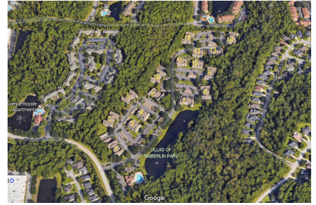
Built in 1997 - 320 units - 3 floors

https://www.thevillasoftimberlinparc.com/main.php?IMenuID=770