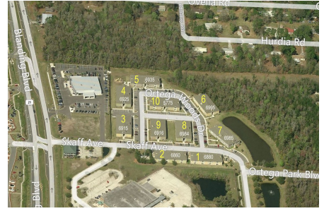
Built in 2007 - 160 units - 2 floors

Number of units: 160 Number of active listings for rent: 4 Number of active listings for sale: 2 Building inventory for sale: 1% Number of sales over the last 12 months: 3 Number of sales over the last 6 months: 0 Number of sales over the last 3 months: 0 Woods Of Ortega Condominium Association Inc 5455 A1a South Saint Augustine, FL 32080 Phone: (904) 584-1160 https://