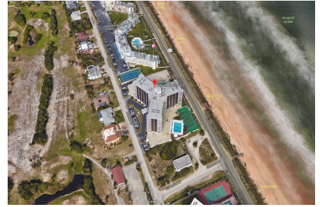
Built in 1982 - 89 units - 9 floors

Number of units: 89 Number of active listings for rent: 2 Number of active listings for sale: 13 Building inventory for sale: 14% Number of sales over the last 12 months: 7 Number of sales over the last 6 months: 6 Number of sales over the last 3 months: 3 Nautilus Condominium Address: 3580 S Ocean Shore Blvd, Flagler Beach, FL 32136 Phone: +1 386-439-5093 https://nautiluscondo.com/