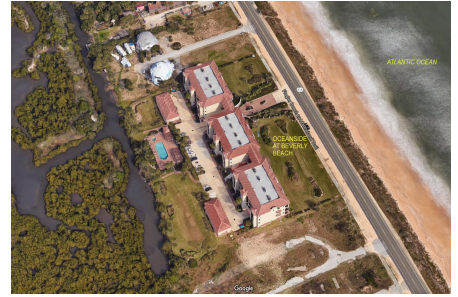
Built in 2007 - 34 units - 3 floors