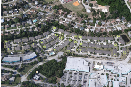
Built in 2002 - 107 units - 1 floor