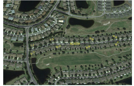
Built in 2001 - 72 units - 1 floor