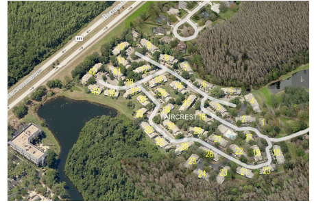
Built in 1999 - 264 units - 2 floors

Number of units: 264 Number of active listings for rent: 5 Number of active listings for sale: 6 Building inventory for sale: 2% Number of sales over the last 12 months: 12 Number of sales over the last 6 months: 9 Number of sales over the last 3 months: 4 Faircrest Condominium Association Inc 5100 Burchette Rd # 1704 Tampa, FL 33647 (813) 972-5666 https://