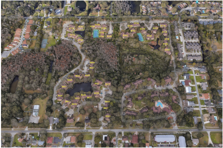
Built in 1988 - 384 units - 2 floors