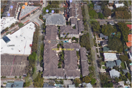
Built in 1996 - 134 units - 4 floors