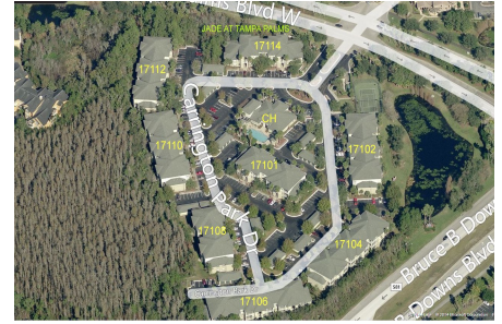
Built in 2004 - 248 units - 3 floors