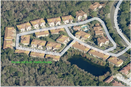
Built in 2004 - 80 units - 2 floors